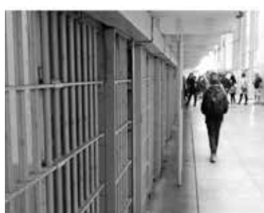
The tour of Alcatraz was haunting