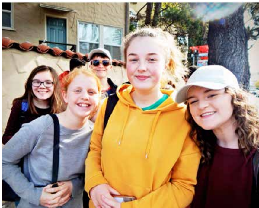
Here come the girls...!

Day 4 found us on the open top bus tour around the city. We got off at a few locations including the Palace of Fine Arts (Star Wars), Golden