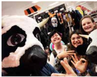
Halloween shopping American style