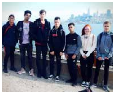
Views of San Francisco from Alcatraz