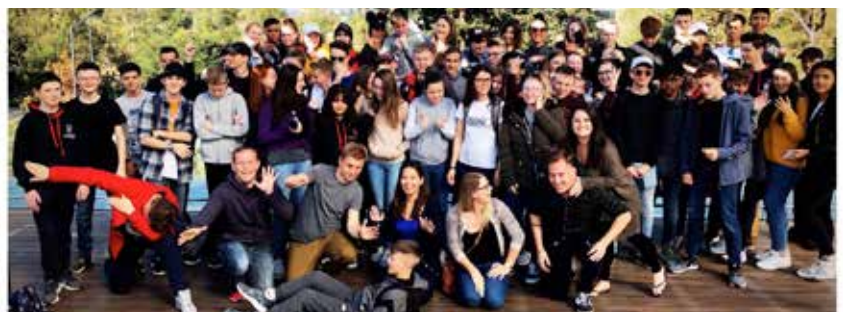
The trip of a lifetime, enjoyed by both the staff and all the pupils.