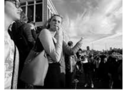
Time for thoughts at Pier 39