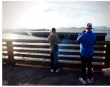
We all took so many photos