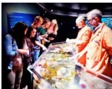
California Academy of Sciences