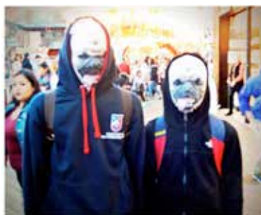
...some might say an improvement?

Gate Bridge and finally the California Academy of Science. This was a spectacular place where they had an aquarium, indoor rainforest, and planetarium. We found out lots of new facts and got to see animals living inside a rainforest.