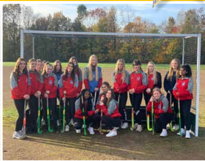
SJHS Year 11 Hockey