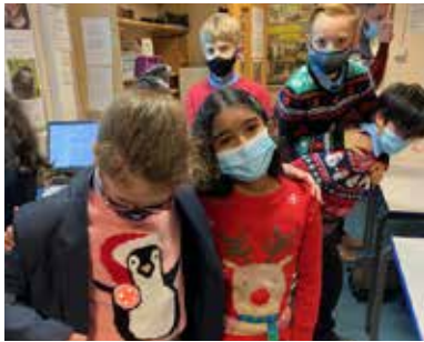
Festive fun with Year 7