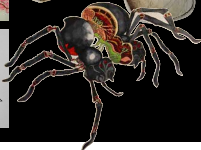
Bright Faces by Sophie Cridland