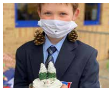
Creativity at its best!