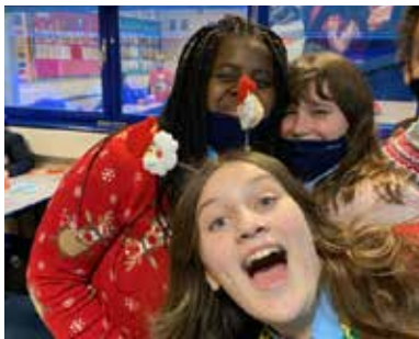
...maybe too much fun!