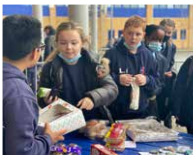
Learning about fundraising, and cake!