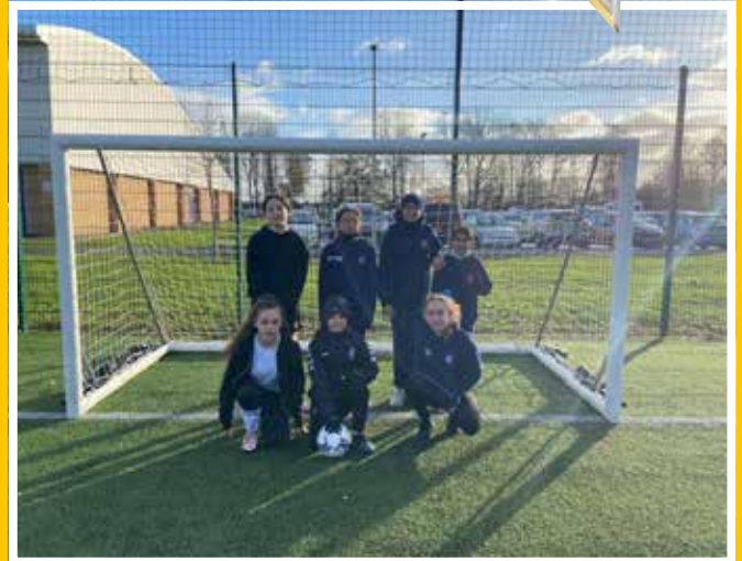
SJHS Year 7 and 8 Girls' Football