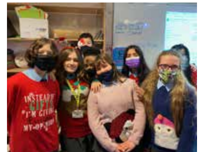
Christmas hug with 70