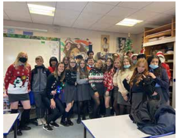
Loving Christmas jumper day No.1