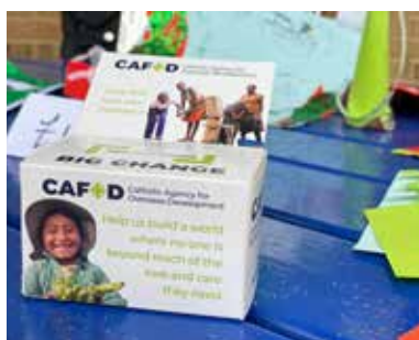
All for a good cause...CAFOD