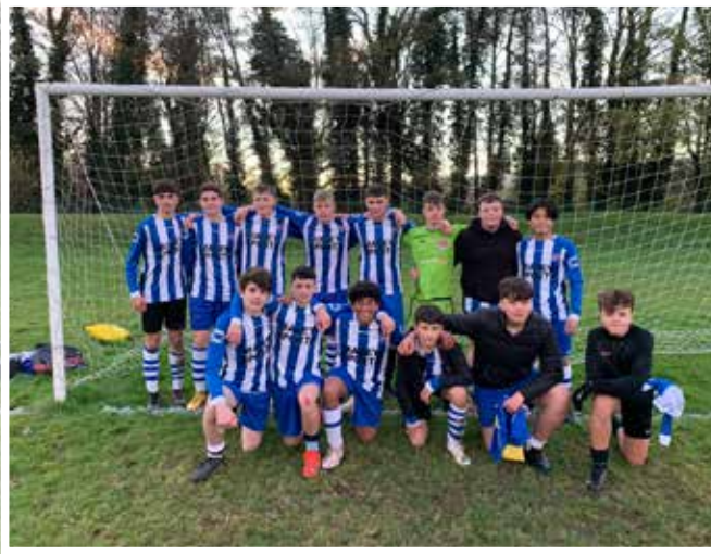
SJHS Year 10 Boys' Football