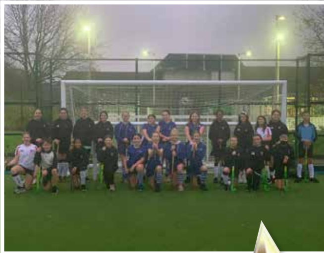
SJHS Year 7 Hockey