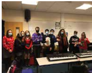
Chritmas carols 10E?