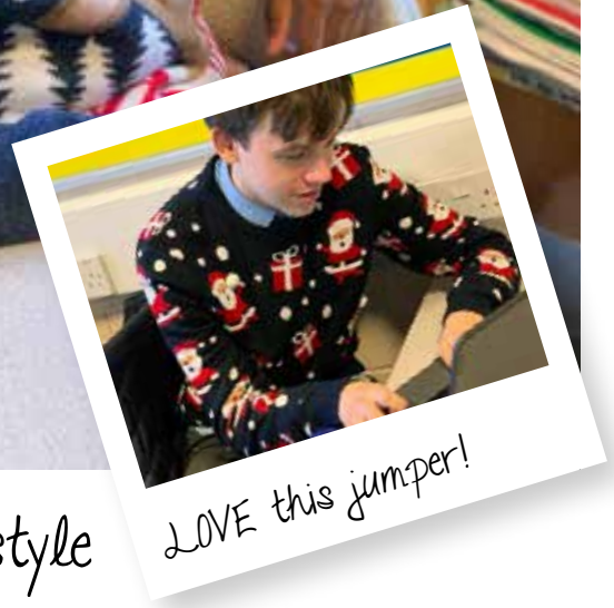
LOVE this jumper!