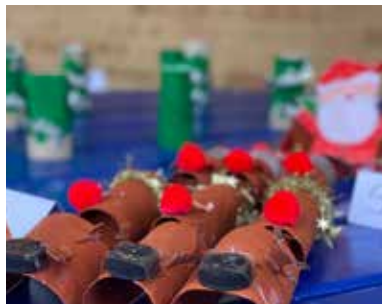
Reindeer bowling anyone?