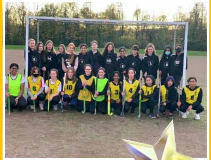
SJHS Year 10 Hockey