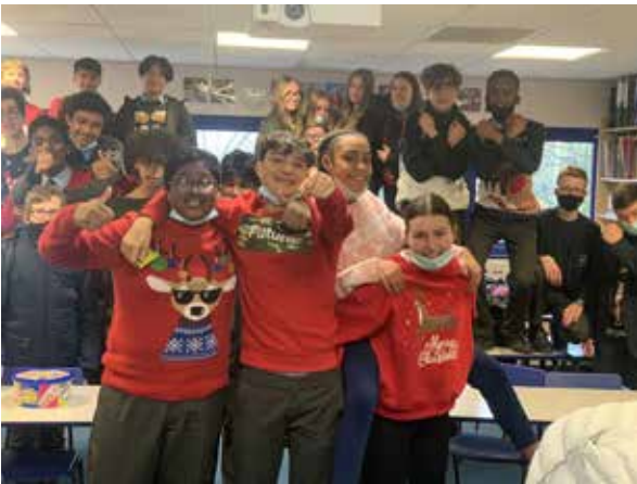
10S looking festive!