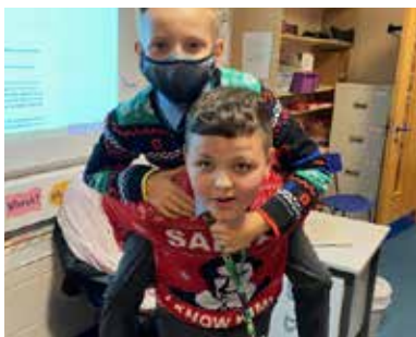
Santa...I know him!!!!