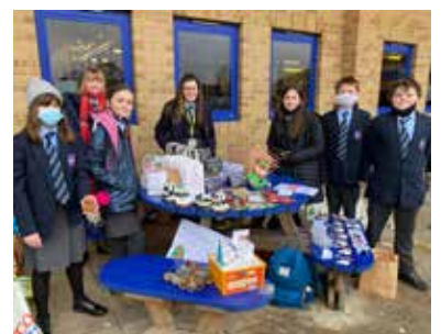
Amazing effort Year 7, thank you.