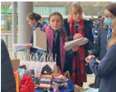
Crackers, cards and Christmas