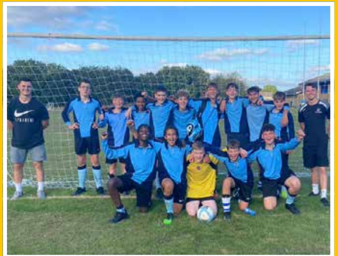
SJHS Year 9 Boys' Football