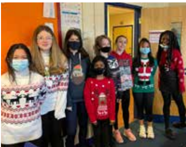
Thank you 8V