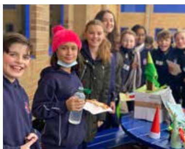
Great team work Year 7