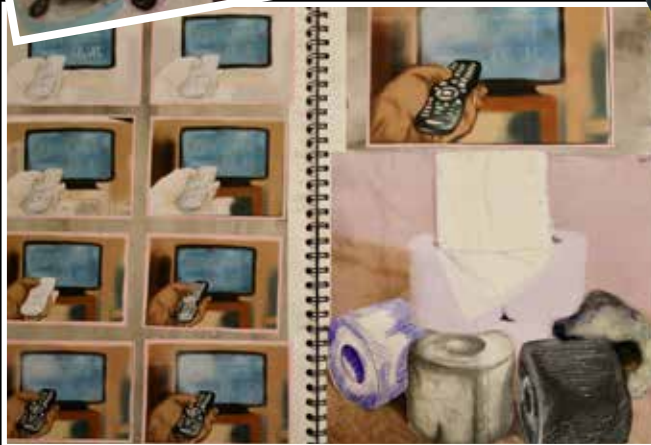
Year 12 and 13 Sketchbook pages