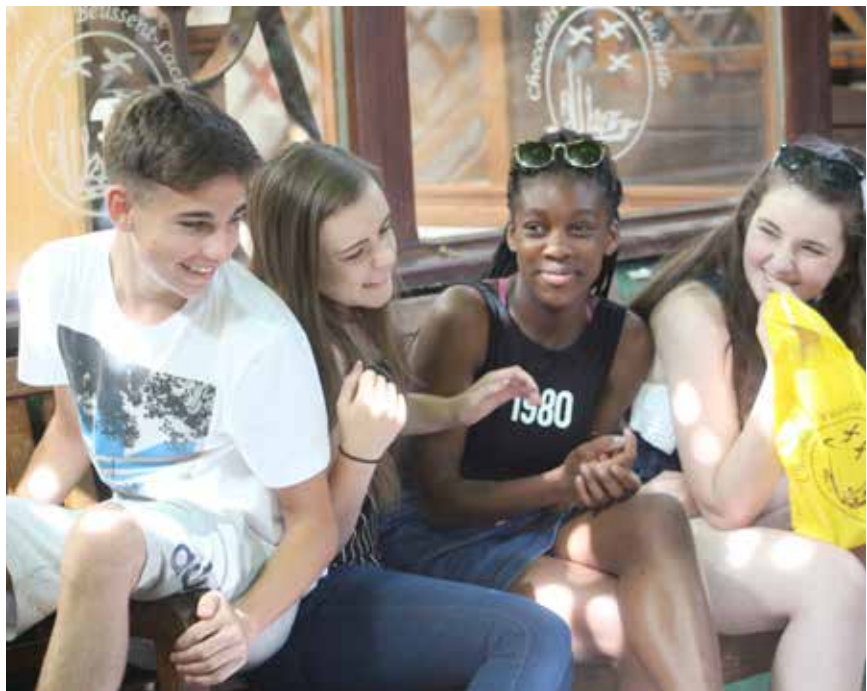
Fighting over the bench in the shade to escape the 43° sunshine!!