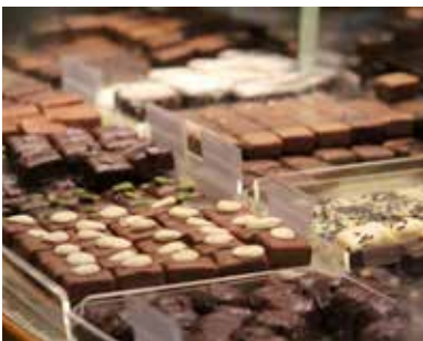
Freshly made from Chocolaterie de Beussent Lachelle...Delicious!