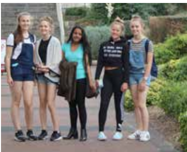
...et les filles !