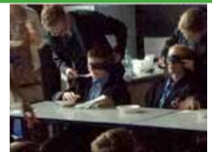
Some VERY brave Year 7 students enduring the Bushtucker trail...