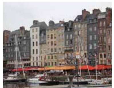
Port de Hornfleur