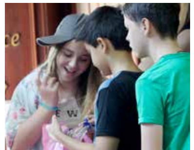
Presents for loved ones back home.