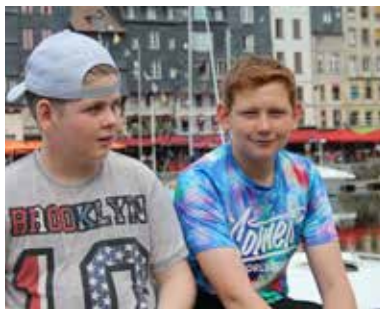
Sitting, chatting and just chillin'